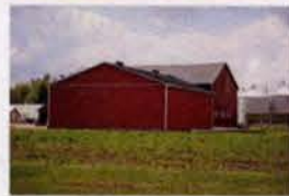
W6 20272 Talbot Line