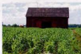
W7 19936 Talbot Line