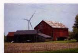
West Elgin W8 19931 Talbot Line