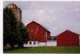
M8 7924 Hacienda Road