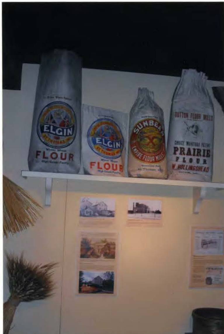
Display: Wheat for Flour Mills in Dutton. Photo taken Oct 6 th / 2011 by Helen Van Buren

More info? 519-631-1460, ext. 154 or www.elgin.ca