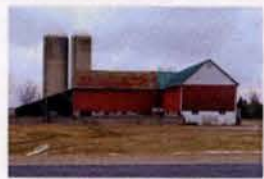
Southwold S1 38814 Fingal Line