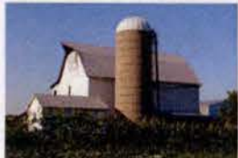
M2 52580 Glencolin Line