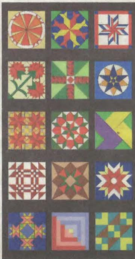
Left: Examples of Barn Quilts as seen on pioneer barns & some of the many designs for Barn Quilts across North America.

Barn owners will be approached in the next several weeks with a request to allow the committee to install a quilt panel on their barn or outbuilding. The grant will fund 20 quilt panels and it is hoped that an additional 10 will be funded through in-kind donations or sponsorship.