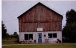
D9 28143 Talbot Line