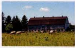
S5 37632 Fingal Line Tufford