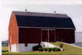
W2 9429 Graham Road