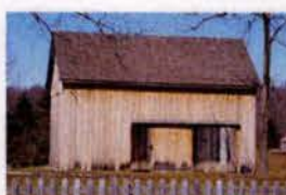
Dutton Dunwich D6 29424 Lakeview Ln Backus Page