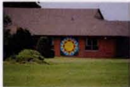
WV3 West Elgin 23328 Beattie Line Wardsville