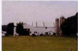
B4 53814 Eden Line