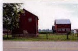
West Elgin W1 26257 Talbot Line