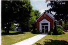
D5 Wallacetown Community Centre