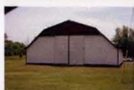
C7 43291 Sparta Line