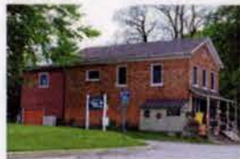
C4 Sparta Store