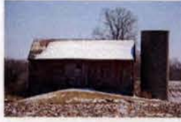
D3 7032 Bradt Road