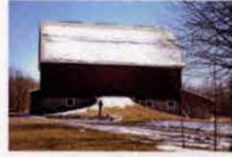
D2 31177 Fingal Line