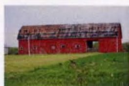
C6 44628 Sparta Line