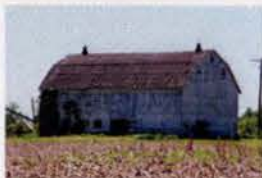
B2 opp 56084 Talbot Line