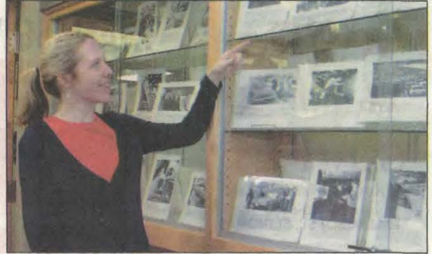
...tory and the mark made by Ford over the years will live on in this special collection."