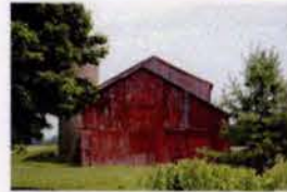
C3 5376 Quaker Road