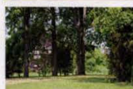
W3 24810 Talbot Line