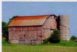
D7 29283 Lakeview Ln Pearce