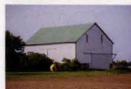
W9 10144 Furnival Road