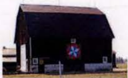
WV2 West Elgin 15611 Morrison Rd