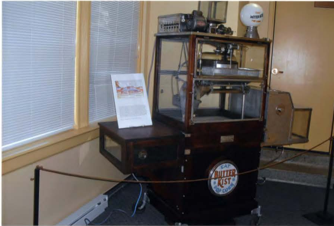
Butter Kist Popcorn Machine.