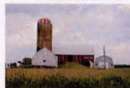
M6 8378 Hacienda Road