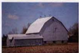
C8 9592 Sunset Road