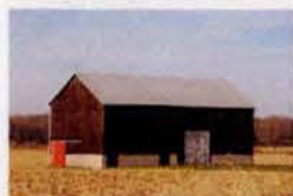
W5 21298 Talbot Line