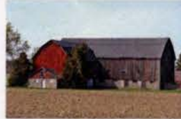
M10 6777 Imperial Road