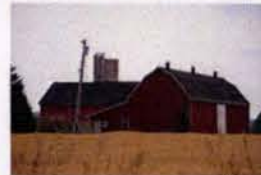
M7 8235 Hacienda Road