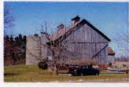
S7 33280 Fingal Line