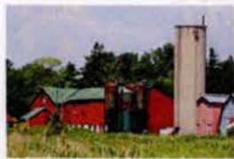
Central Elgin C1 46900 Jamestown Line