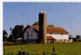
M4 51603 Glencolin Line