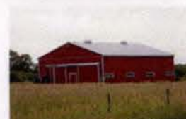
W10 14287 Furnival Road