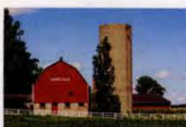
Southwold S3 38266 Fingal Line