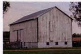
C5 45644 Sparta Line