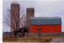
S2 38814 Fingal Line