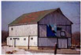
WV1 West Elgin 22924 Johnson Line