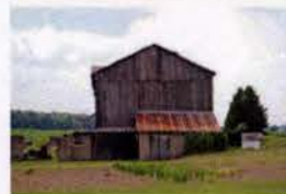
M5 8801 Hacienda Road