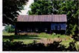
S6 7895 Church Street at Fowler Fingal