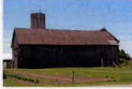
D4 30487 Fingal Line