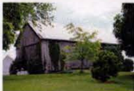
B3 54147 Eden Line