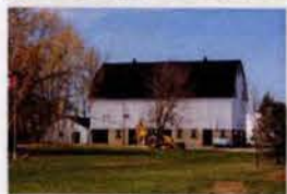
S4 37894 Fingal Line