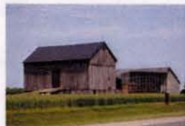
M9 49628 John Wise Line