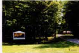
M11 48075 Jamestown Line Dairy Museum