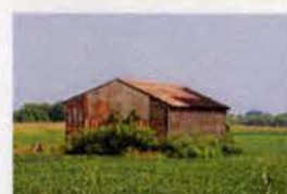
W4 21869 Talbot Line