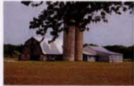
C2 46699 Dexter Line