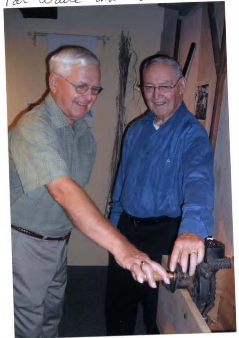
A Coin Sheller - Black Hawk - corn sheller 1900 made by ERIE IRON WORKS. Oct 6 th 2011 ST THOMAS