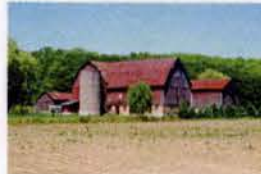
M12 47972 Rush Creek Line